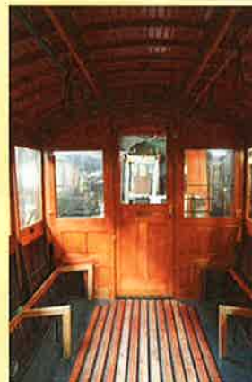
Inside of Mornington Trailer 111 - 16 th Aug 2012