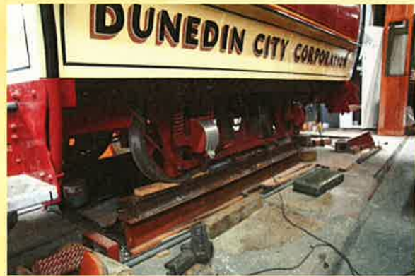
A reminder of the craftsmanship that once rode on the streets of Dunedin...Mornington Trailer 111 being renovated at Ferrymead by THS 16 th Aug 2012

We will be giving three informative talks to interested groups in September. If you belong to a group who would like to hear about the re-creation of the Mornington Cable Car Project then please feel free to contact us!